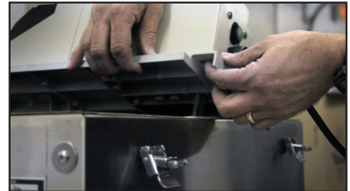
Checking Safety Switch (Interlock Switch) on rear of unit.