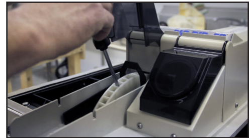
Rotating the Skimming Wheel to Test the Motor