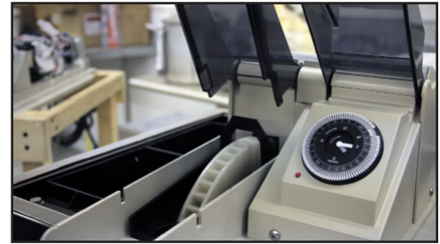
Setting the Timer to Test Motor